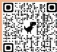
Five Currant Buns

One currant bun in a baker's shop, Big and round with a cherry on top. Along came a boy with a penny one day, Bought a currant bun and took it away.