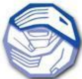
The hand of Christ blesses the cup