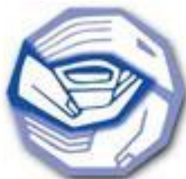
The hand of love offers the cup