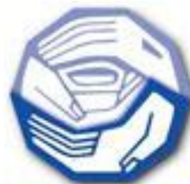
The hand of suffering receives the cup